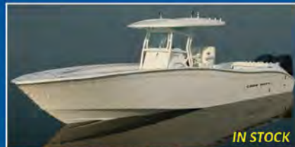
32' CAPE HORN OPEN W/ TWIN 300 HP YAMAHA $182K IN STOCK