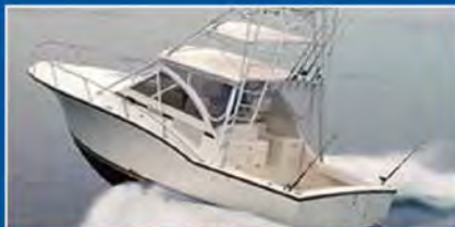
32' CAROLINA CLASSIC FROM $380K