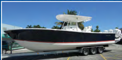
2015 34' REGULATOR, TRIPLE 300 YAMAHA'S, LOADED, 371K

300 N FEDERAL HWY DANIA BEACH, FL 33004 (954) 921-8800 COZYCOVEMARINA.COM