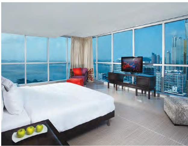
HARD ROCK HOTEL PHOTOS